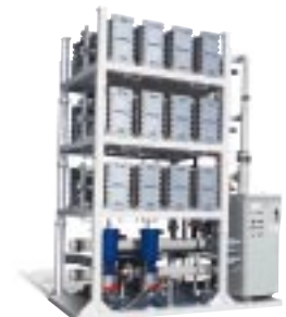
300 gpm (68 m 3 /h)