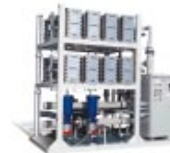
200 gpm (45 m 3 /h)