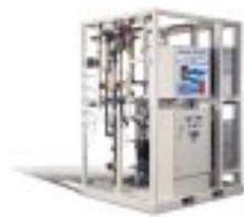
25 gpm (6 m 3 /h)

Using the six standard E-Cell Systems™, you can configure any size installation to meet your flow requirements. You can also design E-Cell Systems™ using the 12.5 gpm (3 m 3 /h) stack, from the ground up incorporating your own design specifications.