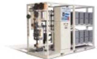
100 gpm (23 m 3 /h)