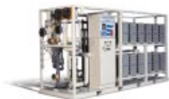
150 gpm (34 m 3 /h)