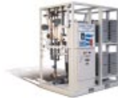
50 gpm (11 m 3 /h)